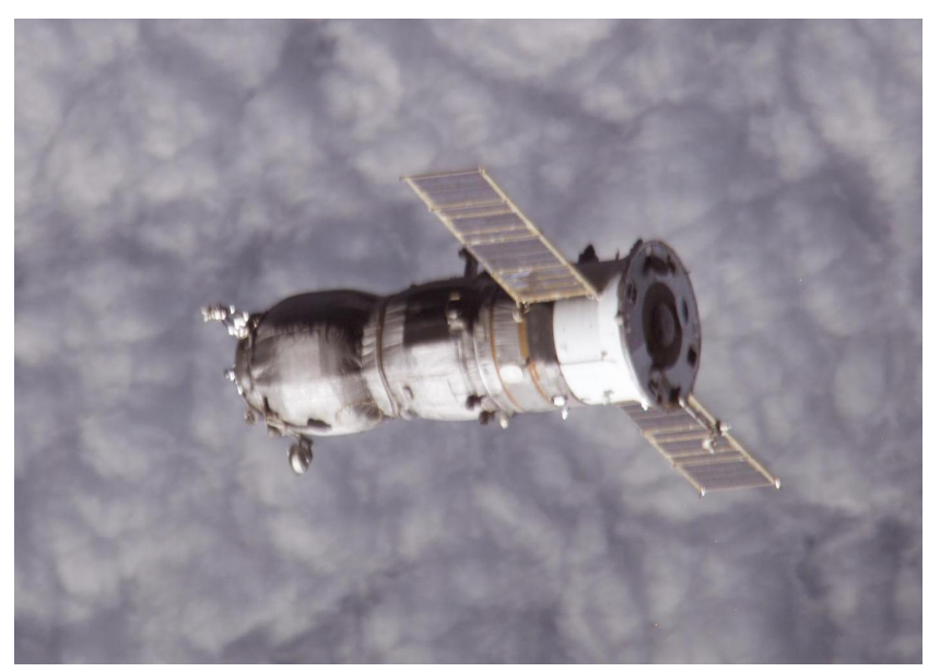
The Progress Cargo Ship Departing the ISS

The Progress 51P vehicle (M-19M, No. 419) successfully undocked from the ISS Russian Segment Service Module (SM) aft docking port at GMT 162/13:58:13 after the command to open the vehicle hooks was issued at 162/13:56:00. The separation appeared smooth with no vibrations noted [this was likely from video capture...the previous pages of this handbook show that SAMS did register this event]. Video from the Progress vehicle showed that the docking ring surface appeared nominal and free of debris. Telemetry indicated that the ACΦ-02 deployed post hook opening. Preundocking analysis by the CAMMP group indicated that during this antenna deployment a nominal clearance of 2 mm between the antennae and in other SM obstructions should have existed. The first separation burn [by the Progress vehicle?] was initiated at approximately 162/14:01:13 and was completed at approximately 162/14:01:28. Following several days of the Russian Radar-Progress experiment, the deorbit of the vehicle is planned for GMT 170 (June 19th, 2013) starting at approximately 7:52 a. m. Houston time. No prop consumed during 51P Undocking. The undocking was conducted solely via CMGs.